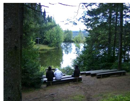
Only God knows what life holds for these three boys. But we can give them this moment.

has had periods of further abandonment, homelessness, and multiple school changes. At times, he has been enveloped in fog from attempts to use medication to treat a childhood of chaos and loss. In spite of all this, he is a good student, and now wants to be