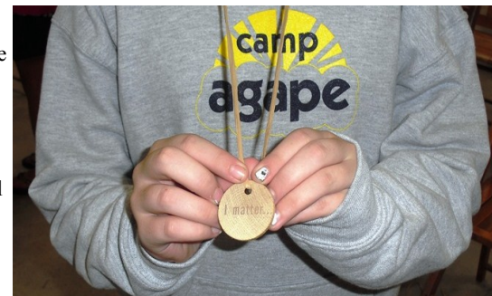
A camper shows off her “I Matter” coin.