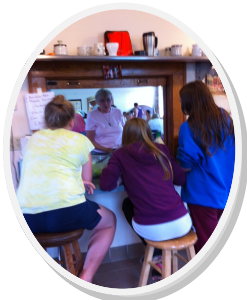
Older campers taking meal orders at the Christ Church Full Ladle Soup Kitchen in Montpelier

in an effort to keep camp affordable. Finding a new camp home meant a significant rise in camp fees, no matter where we looked. Our top priorities were the safety of the children in our care, and living into our mission. We believe that Bethany Birches will enable us to fulfill these goals. The budget increase is due to increased camp fees, transportation, and equipment costs, but we feel it is well worth it.