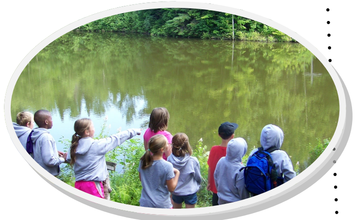
Did you see that?

and sing and talk about God's love for us all. We will be having two groups for "Older Kids" this year. We have registered ten 13-15 year olds. They have a combined history of 51 years of coming to Camp Agape! They are growing up with the knowledge that agape , unconditional love and acceptance, is always there for them.