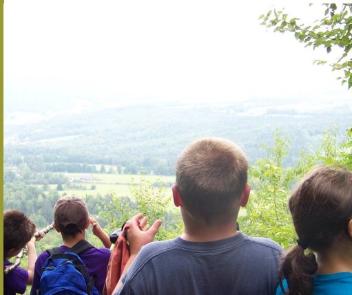
A mountaintop experience at Covenant Hills Christian Camp

To provide a free summer camping experience, in a setting of agape (the kind of unconditional love God has for each of us) for Vermont children who have experienced the incarceration of a parent or caregiver